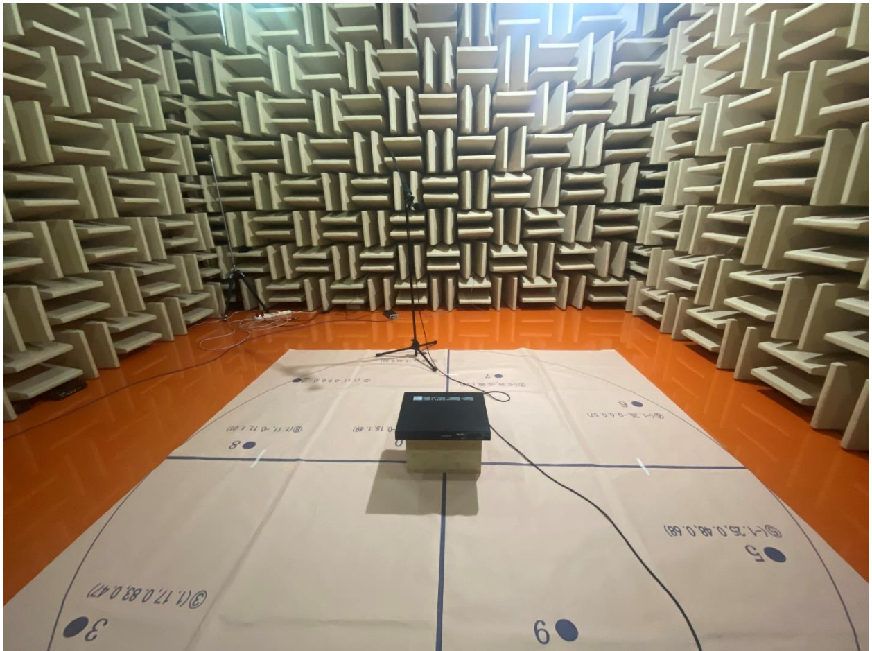
Figure 1 Setup